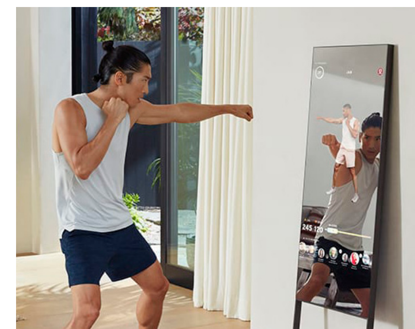
Mirror The Mirror $1686 – 2809 USD

Has he wanted a pouch but never found the right one? This one feels like a contemporary artpiece with its geometric lines and will feel distinct and inspired. The Puzzle bag is the debut bag for LOEWE by Creative Director Jonathan Anderson. A cuboid shape and precise cutting technique create Puzzle's distinctive geometric lines and angles.