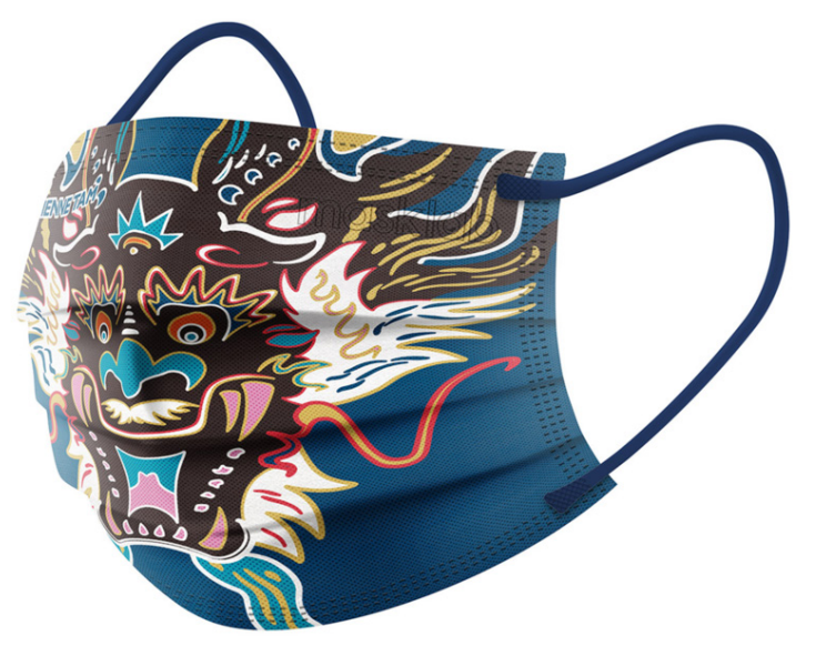
Vivienne Tam V_Dragon 3-ply Surgical Mask $15 USD

Fashion x Sport. For the basketball lover who also enjoys luxury, this special edition of the LV Bold derby is part of the Louis Vuitton x NBA collection of accessories, leather goods and ready-to-wear. Crafted from iconic Monogram canvas, it features a textile tongue with the NBA logo in gold, while the laces are secured by a sporty toggle.