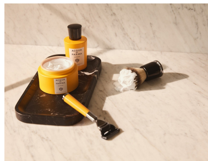
Acqua di Parma Barbiere Yellow Razor & Brush $850 CAD

For someone who values fitness and convenience, especially after having limited gym access during the pandemic. When it's off, it's a mirror. When it's on, it's the world's first interactive smart gym with you at the center. It is a nearly invisible home gym and compatible in any home. With a small footprint and elegant design, this is a gift that turns less than two feet of wall space into a personal fitness studio.