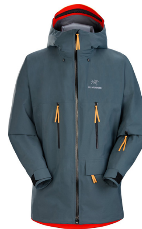
Arc'teryx Jacket Jil Sander + Men's $2370 CAD

Is he an adventurer of the outdoors? This jacket is a great choice for those who love the slopes. GORE-TEX ski and snowboard shell designed in collaboration with Jil Sander+.