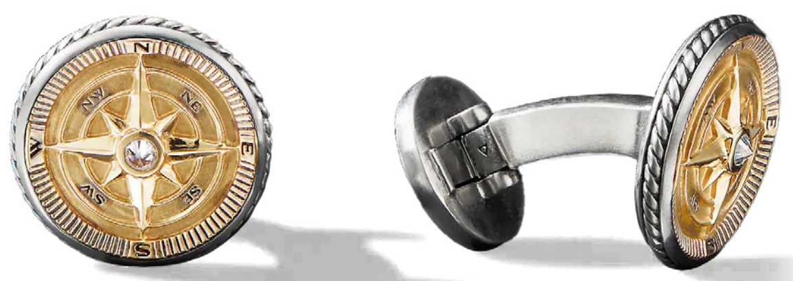
David Yurman Maritime® Compass Cufflinks with 18K Yellow Gold and Center Diamond $2000 CAD

Have him covered for walking in all weather. Designed for city and country, the new Men's Balmoral Hybrid Chelsea Boot bridges the divide between rural paths and urban parks. It delivers comfort, grip and weather protection across many terrains. First introduced in 1987, the Balmoral collection embodies Hunter's philosophy and heritage of pioneering design for those who require excellence in all weathers and landscapes.