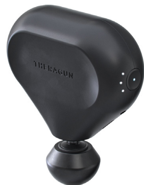
Therabody Theragun Mini Percussive Therapy Device $250 CAD

Bracelets are sometimes hard to find for men. Lava beads are paired with rare quartz, rose gold plated discs and a gold painted fire agate on a stretch cord for a striking approach to men's jewellery.