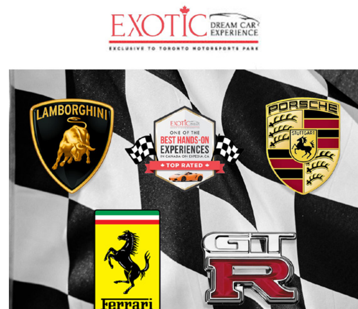
Toronto Motorsports Park Cayuga Exotic Dream Car Experience – Premium $299 – 799 CAD

The Exotic Dream Car Experience runs on our 1.8 kilometre road racing circuit configuration and provides you with the opportunity to drive an exotic dream car of your choice from the list below, in a safe and controlled environment. Between registration, in-class briefing, two track discovery laps and your drive time, you can expect to be at the event for approximately 2 ½ hours. The actual driving time on the road course will depend on your skill level and the number of laps you purchase.