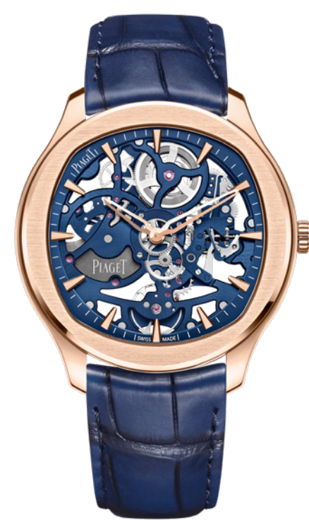
Piaget Piaget Polo Skeleton Watch $58000 CAD

Watches have been a reliable investment and heirlooms to pass onto the next generation, and you can't go wrong with a Rolex. This Oyster Perpetual Cosmograph Daytona in 18 ct white gold with a meteorite and black dial and an Oysterflex bracelet, features a Black Cerachrom bezel with tachymetric scale.