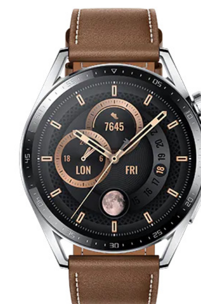
Huawei Watch GT 3 Coming Soon to Canada

Pyjamas certainly made a comeback during the pandemic, and though perhaps the work-from-home days are soon over, everyone wants to jump back into pj's after work. Crafted of a breathable cotton, these DESMOND & DEMPSEY pyjamas are fit like a jacket and the pants have a drawstring waistband. The bold, hand-drawn print is inspired by New Zealand's national bird and vintage postal stamps.