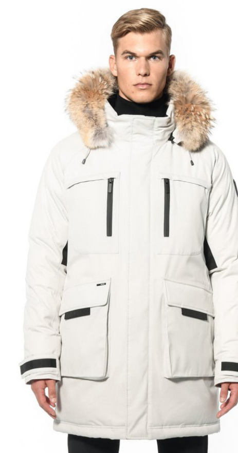
Nobis Kalvin Men's Parka $1295 USD

Something Canadian and fabulous for someone who has more formal events and meetings. Iconic SENTALER design with the Signature Double Collar featuring quilted lining with light filling inside. Crafted from plush-feel and textured Boucle Alpaca, the heaviest fabric in the collection.