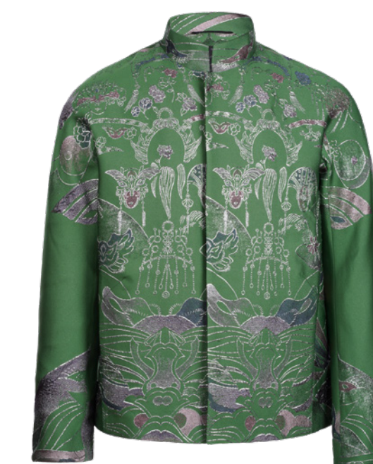
Shiatzy Chen Exclusive Jacquard Mandarin Collar Coat $1686 – 2809 USD

Snowy white, Canadian and modern, this piece is great for daytime commutes through to the evening arrival at a festive gathering. Tackle this Winter with the Kalvin. This all-around jacket has multiple pockets for maximum storage, and a removable hood for those calmer days.