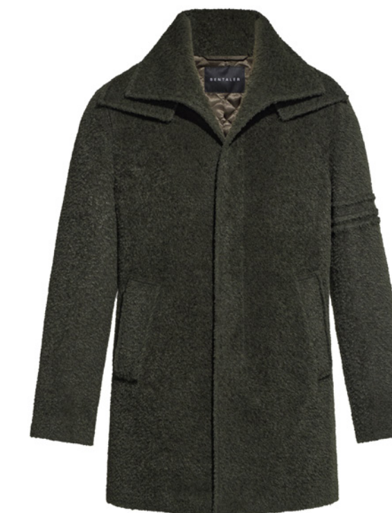
Sentaler Technical Bouclé Alpaca Double Collar Topcoat (army green) $2,395 CAD (pre-order)

Is he an adventurer of the outdoors? This jacket is a great choice for those who love the slopes. GORE-TEX ski and snowboard shell designed in collaboration with Jil Sander+.