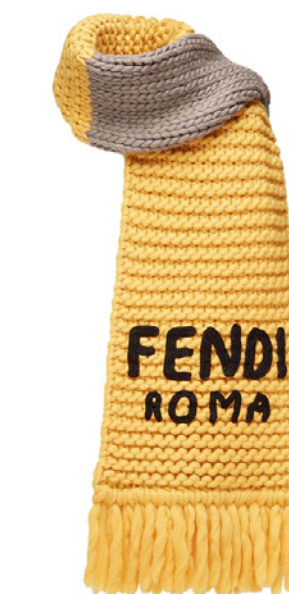
Fendi Yellow Wool Scarf $1390 CAD

Oura translates your body signals and daily habits into actionable insights you can use to stay active and improve your overall health. The most accurate consumer sleep tracker.