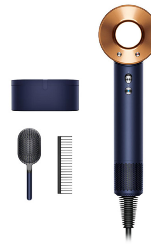
Dyson Special Edition Dyson Supersonic™ hair dryer (Prussian Blue Rich Copper) $499.99 USD

It's the tool that many women own that make their husbands envious. The Dyson Supersonic™ hair dryer is efficient, sleek in design and light to handle. Now available in this beautiful copper and deep blue colour palette, which makes it a stunning tool in the bathroom. Five styling attachments. Including the new Flyaway attachment. Intelligent heat control.