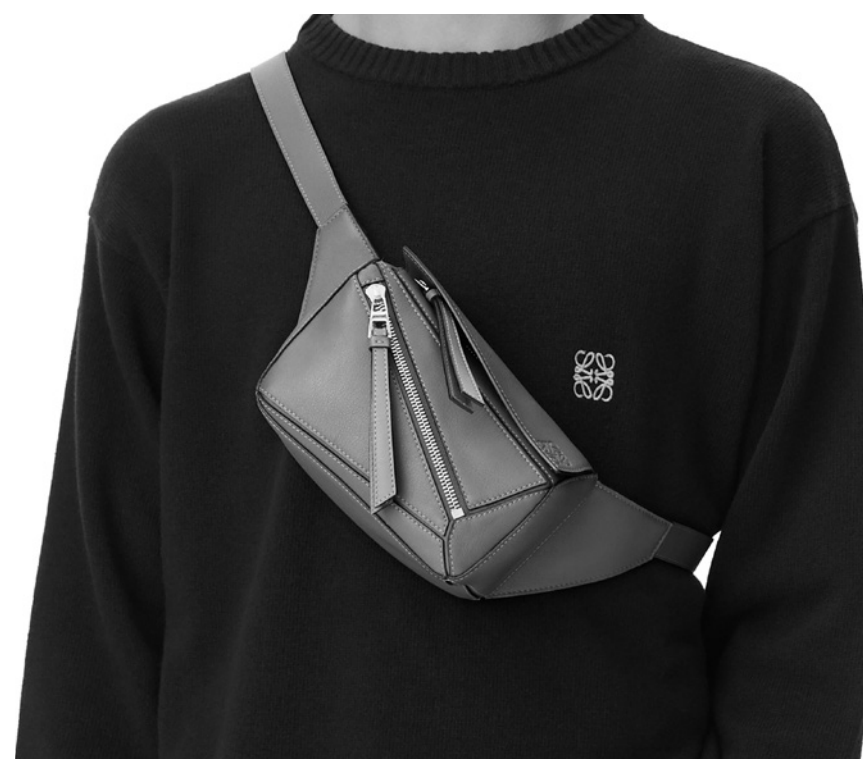
Loewe Mini Puzzle Bumbag in Classic Calfskin $2520 CAD

Comfort, sport culture and luxury all in one, and made in 100% cotton which is breathable. This relaxed hoodie channels the season's NBA theme in an array of embroidered patches, with cream topstitching. It is tailored in a slightly loose fit, from a cotton jacquard Monogram base that has been specially washed to create a vintage effect.