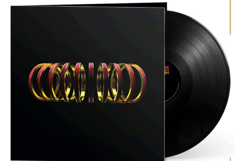
SHANG-CHI Soundtrack Vinyl $25 CAD

For the fashion lover who loves to show off bold and interesting designs. Rectangular scarf made of yellow wool with gray lining. Decorated with fringes and Fendi Roma embroidery.