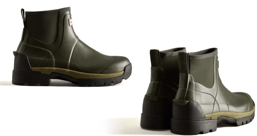
Hunter Men's Balmoral Field Hybrid Chelsea Boots $265 CAD

Protect yourself with a beautiful cultural print with these modern masks. 3-PLY Earloop Surgical Mask with Vivienne Tam's V-Dragon design print. 10 masks per box.