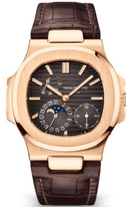
Patek Philippe 5712R Date, Moon Phases Price Upon Request

A watch represents the gift of time and a page in history. Gift this Piaget Polo Skeleton watch, 42 mm, for an unforgettable choice. Case in 18K rose gold. Interchangeable strap. Sapphire crystal case back.