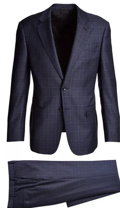
Giorgio Armani Soft Construction Windowpane Wool Suit $3875 CAD (Available at Harry Rosen)

Product contains milk and soya. May contain traces of nuts and/or gluten. Made in the United Kingdom