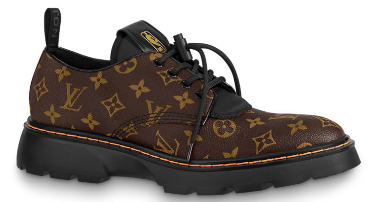
LV x NBA LVxNBA LV Bold Derby $1340 CAD

The rounded octagonal shape of its bezel reminds us of shapes in Chinese architecture. The ingenious porthole construction of its case, and its horizontally embossed dial are elegant features of the Nautilus, an iconic sports watch since 1976.