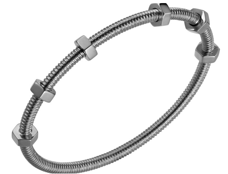
Cartier Erou de Cartier Bracelet $7800 CAD

It's the tool that many women own that make their husbands envious. The Dyson Supersonic™ hair dryer is efficient, sleek in design and light to handle. Now available in this beautiful copper and deep blue colour palette, which makes it a stunning tool in the bathroom. Five styling attachments. Including the new Flyaway attachment. Intelligent heat control.