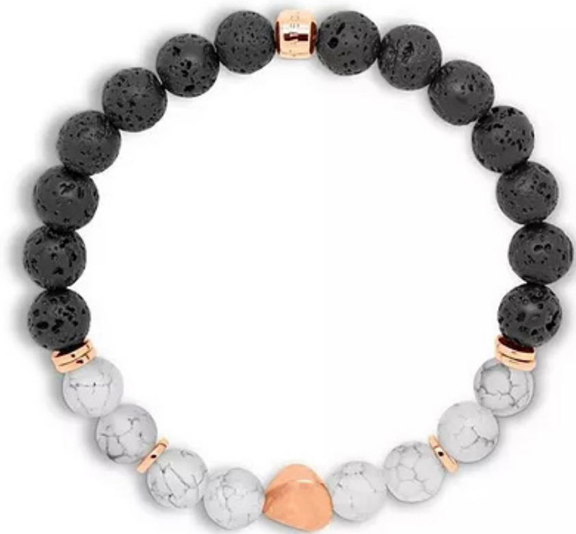
Tateossian London Lava Bead Bracelet $395 CAD (Available at Harry Rosen)

Apple AirTag Hermes key ring in Orange Swift calfskin. You can easily find your keys with the "Find My" application on your iPhone or iPad, whether it's at hand or on the other side of the world. Exclusive AirTag Hermes etched with the iconic Clou de Selle signature. Leather accessory made in France