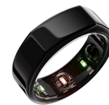
Oura New Oura Ring Generation 3 $299 USD

For a masculine and yet detailed accessory, the Erou de Cartier bracelet, has a non-rhodiumized finish 18K white gold.