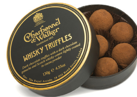
Charbonnel et Walker Whisky Truffle $32 CAD (Available at Holt Renfrew)

For the avid athlete or someone who has a strenuous job. This item is tried and tested by our Editor-in-Chief as well! Compact and powerful, this pocket-sized percussive therapy device that gives you quality deep muscle treatment with unparalleled portability. Featuring the QX35 brushless motor with QuietForce Technology™, the mini strikes a never-before-seen balance between power and size, making it a convenient option for getting relief on the go.