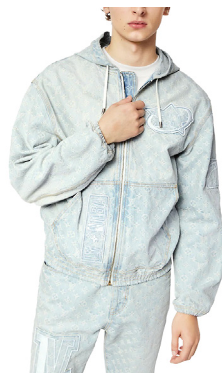
LV x NBA LVxNBA Zip-Through Hoodie $3700 CAD

Comfort, sport culture and luxury all in one, and made in 100% cotton which is breathable. This relaxed hoodie channels the season's NBA theme in an array of embroidered patches, with cream topstitching. It is tailored in a slightly loose fit, from a cotton jacquard Monogram base that has been specially washed to create a vintage effect.