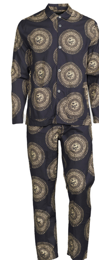
Desmond & Dempsey Pocket Cotton Pajama Set In Stamp Print $275 CAD (Available at Holt Renfrew)

Events and meetings are already back. In case pre-pandemic suits no longer fit or if his closet needs a refresh, this Giorgio Armani design typifies the house's elegant European sensibility and soft-shouldered tailoring. The comfortably fit two-piece is constructed in Italy from lightweight virgin wool that's ideal for year-round wearing. It's an endlessly versatile and stylish suiting option from office to evening out.