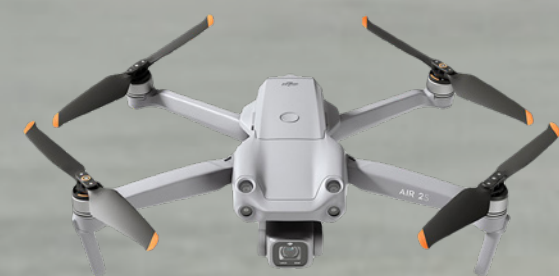
DJI Air 2S $999 USD

Gadgets are always desired, especially when it lets you capture aerial views of cottage and ski trips. See the world from a different perspective through the DJI Air 2S Quadcopter drone with camera and controller. It reaches up to 5,000 metres high and touches a speed of 21.6 km/h to cover everything from vast stretches of landscapes to exhilarating actions.