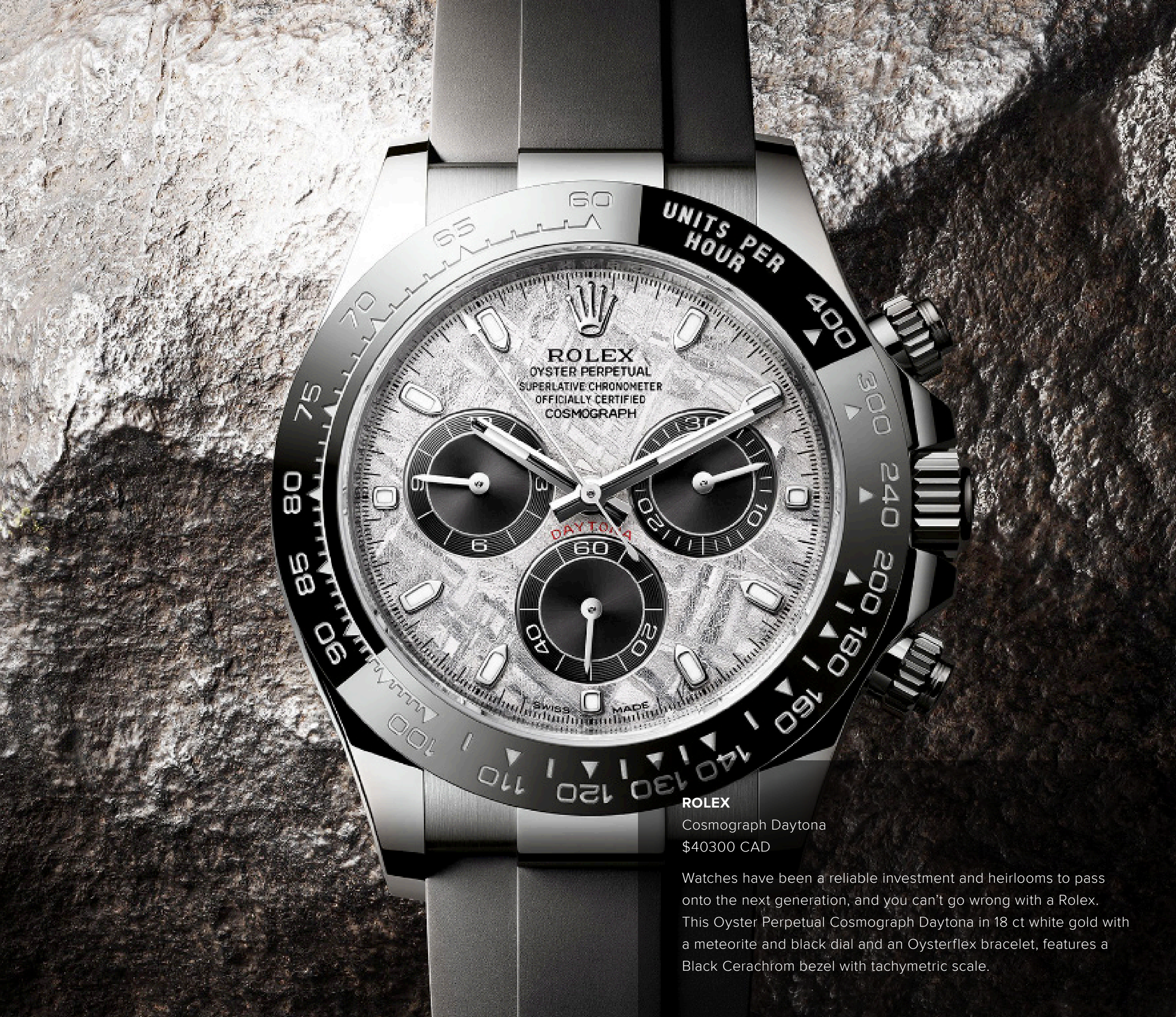
ROLEX Cosmograph Daytona $40300 CAD

Watches have been a reliable investment and heirlooms to pass onto the next generation, and you can't go wrong with a Rolex. This Oyster Perpetual Cosmograph Daytona in 18 ct white gold with a meteorite and black dial and an Oysterflex bracelet, features a Black Cerachrom bezel with tachymetric scale.