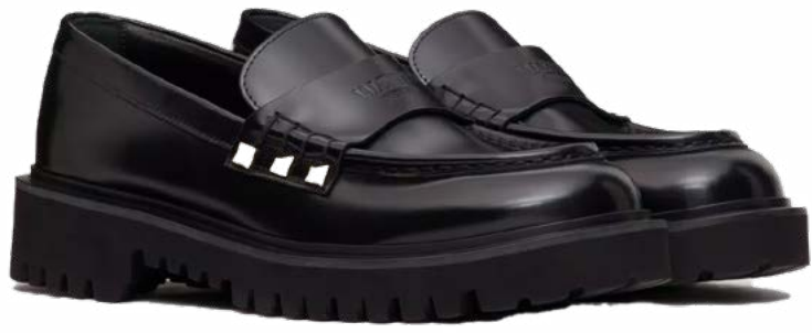
Valentino Rockstud Calfskin Loafer $1260 CAD

Valentino Garavani Rockstud loafer in calfskin, featuring platinum-finish studs and the Valentino Garavani logo embossed on the tongue. Made in Italy for a touch of luxury.