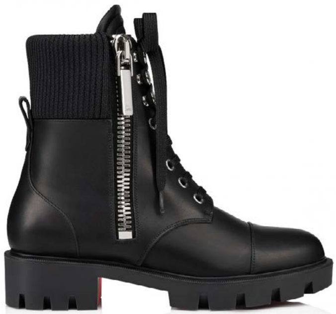
Christian Louboutin En Hiver Lug $2095 CAD

The Gomettine, drawing inspiration from the iconic Gomette, embraces the trend with its retro silhouette. Handcrafted in leather, these ballerinas feature a resin buckle and a low, structured heel.