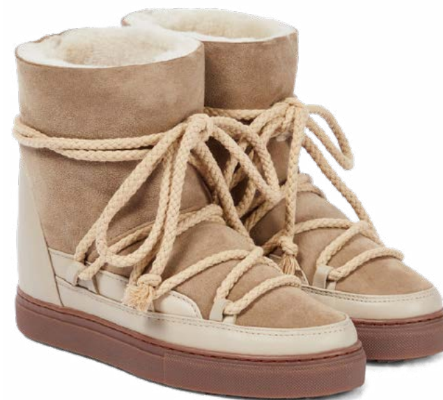
INUIKII from mytheresa Classic Wedge leather ankle boots $384 CAD

Inspired by biker boots, the En Hiver Lug ankle boot from Maison Christian Louboutin offers a contemporary aesthetic. Crafted in black patent calf leather, this model rests on a lug sole. The front lacing is paired with an oversized silver side zip, adding to its modern appeal.