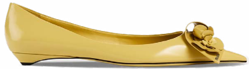
Prada From Holt Renfrew Floral Appliqué Leather Ballet Flats $1390 CAD

Valentino Garavani Rockstud loafer in calfskin, featuring platinum-finish studs and the Valentino Garavani logo embossed on the tongue. Made in Italy for a touch of luxury.