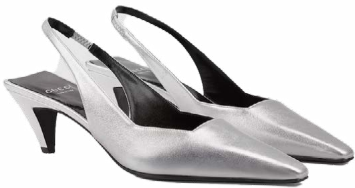
Gucci Women's Slingback Pump $1225 CAD

Radiating a blend of minimalist sophistication and whimsical exuberance, these slip-on flats are crafted from leather and adorned with a delicate floral appliqué protruding from the toe.