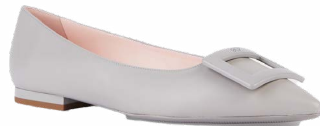
ROGER VIVIER from Holt Renfrew Gomettine Leather Ballerinas $845 CAD

This slingback pump, drawing inspiration from 1990s archives, is a modern take with a metallic silver leather silhouette, elongated toe shape, squared back, and contemporary cut. The cone-shaped heel at the back is subtly adorned with the silver Interlocking G logo, adding a discreet reference to the House's identity.