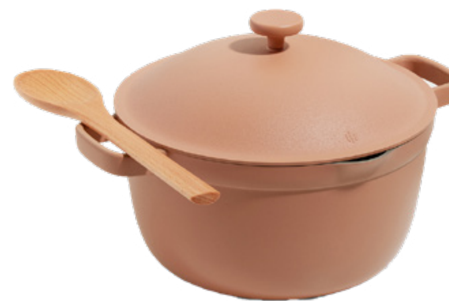
OUR PLACE by Holt Renfrew Perfect Pot $220 CAD

Made with the same game-changing ingenuity that made OUR PLACE's Always Pan a sellout, The Perfect Pot does everything from boiling to baking, crisping to steaming. With the Perfect Pot you can boil, crisp, bake, braise, roast, steam, strain, pour, serve, and store.