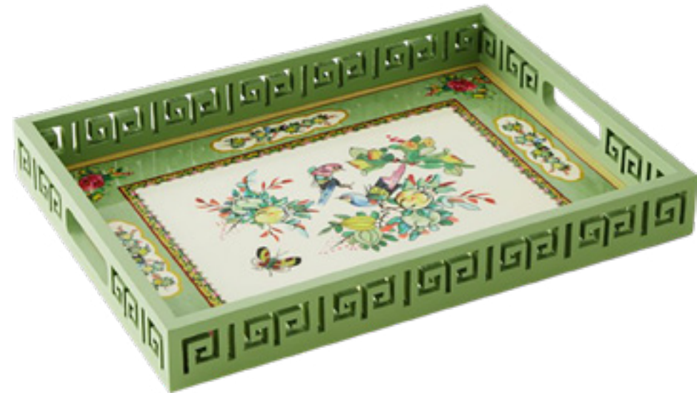
Williams Sonoma Familie Rose Tray $217.95 CAD

Hand-painted with a golden rim, this bunny portrait plate can be used as a trinket tray, appetizers plate, or even a soap dish.