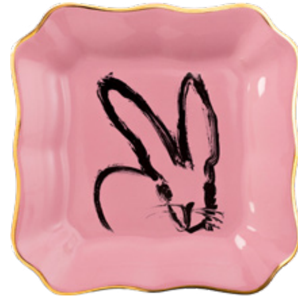
HUNT SLONEM from Holt Renfrew Bunny Portrait Plate $65 CAD

Bone china porcelain serving tray in white. Graphic printed in tones of blue at face. Logo printed at base.