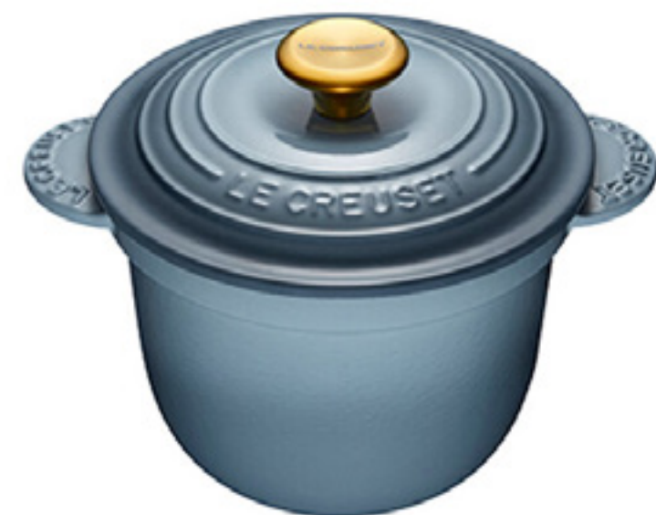
Le Creuset Rice Pot in Chambray $335 CAD

Our Kone Tea Kettle delivers the aroma of freshly brewed tea or coffee all-while making for a stylish addition to your kitchen. Our Kone Tea Kettle is equally suited for traditional and contemporary kitchen decors, bringing a stunning new look to your stovetop.