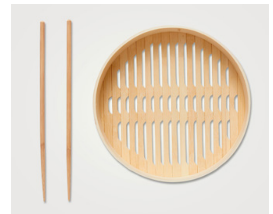
OUR PLACE by Holt Renfrew Spruce Steamer Basket $50 CAD

Made with the same game-changing ingenuity that made OUR PLACE's Always Pan a sellout, The Perfect Pot does everything from boiling to baking, crisping to steaming. With the Perfect Pot you can boil, crisp, bake, braise, roast, steam, strain, pour, serve, and store.