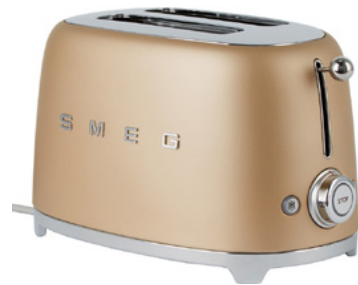
SMEG Gold Matte Retro-Style 2 Slice Toaster $220 CAD

Designed as an electric version of the Stagg Pour-Over Kettle, the minimalist Stagg EKG gives you ultimate control. It's the same great kettle with an intuitive, steady pour from Stagg's precision pour spout but with the added electric variable temperature control that will let you brew with greater ease and more control over every variable.