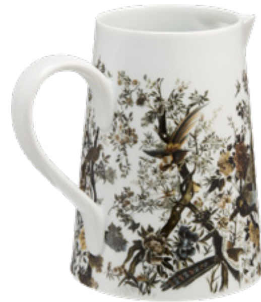
Dior CARAFE $750 CAD

Inspired by the "famille rose" Chinese porcelain designs introduced in the 18 th century, our vibrant tray features an array of fantastical birds and blooms in an eye-catching colour palette. It's framed by hand carved scrolling sides and finished with enamel that's durable enough for both everyday dining and special occasions. Use it as a singular statement piece or layer it in with the other pieces from the dinnerware collection.