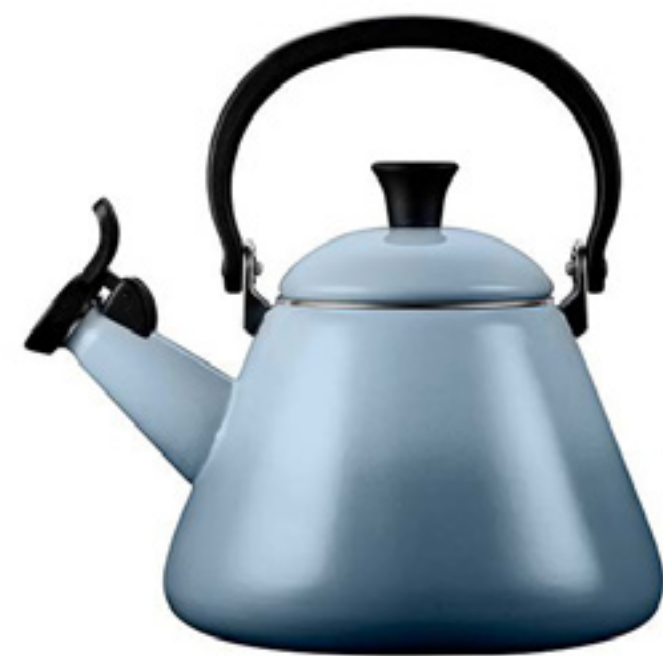
Le Creuset Kone Kettle in Chambray $135 CAD

Our Kone Tea Kettle delivers the aroma of freshly brewed tea or coffee all-while making for a stylish addition to your kitchen. Our Kone Tea Kettle is equally suited for traditional and contemporary kitchen decors, bringing a stunning new look to your stovetop.