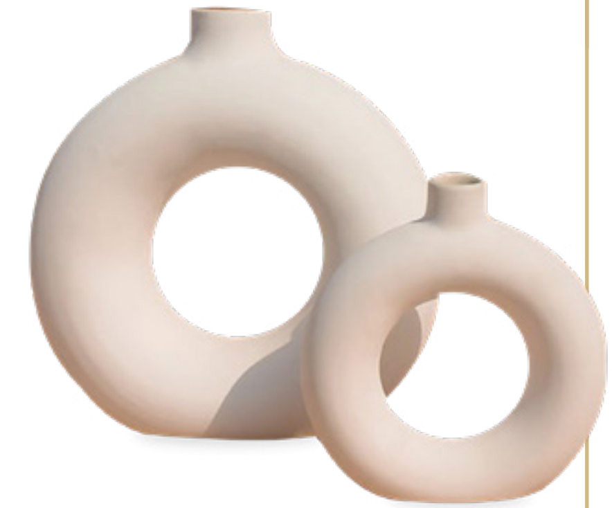
mkt Moon Vase $65 – $95 CAD

Inspired by the House's historic trunk collection, the Petite Malle Porcelain vase echoes the design of its iconic namesake. Signature details of the handbag, such as the Monogram pattern and S-lock hardware, are embossed on a delicate porcelain surface. This spring gift item is an elegant setting for the season's fresh blooms.