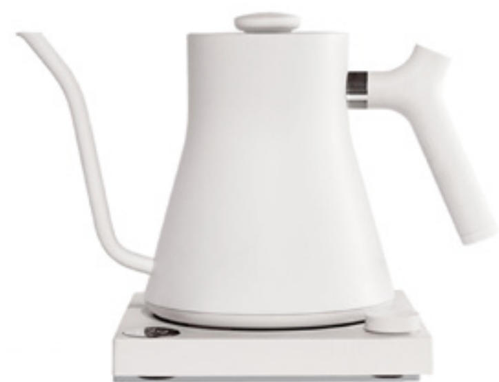
FELLOW Stagg EKG Electric Pour Over Kettle $215 CAD

Enamelled cast iron Rice Pot is ideal for preparing the perfect batch of rice every single time. Our rice pot makes for a bold centerpiece to your dinner table with its stylish design.