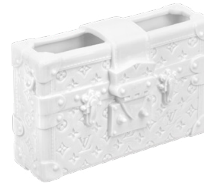
Louis Vuitton Petite Malle Porcelain Vase Call for inquiry