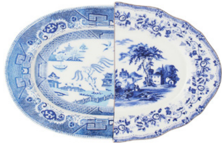
SELETTI from SSENSE White Hybrid Diomira Tray $220 CAD

Bone china porcelain serving tray in white. Graphic printed in tones of blue at face. Logo printed at base.