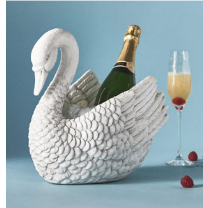
anthropologie Matilda Goad & Co. Swan Planter $88 – $178 CAD

Without further ado, even before consulting the architect, I said yes and put all of my heart into decorating this new home. This is how Christian Dior described his love at first sight for the apartment at 7 Boulevard Jules-Sandeau in the 16 th arrondissement of Paris. Fascinated by his passion for the art of living, Maria Grazia Chiuri draws inspiration from this unique address - and more specifically from Mr. Dior's winter garden, embodied in a silk panel embroidered with plants, flowers and birds.