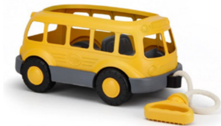
Pottery Barn Kids Green Toys® School Bus Wagon $53

The Kinderscooter is crafted with sustainably-sourced birchwood, beechwood, water-based paints and child-safe finishings. While exploring the world on wheels, little ones develop their balance and coordination, strengthen gross motor skills and gain confidence.