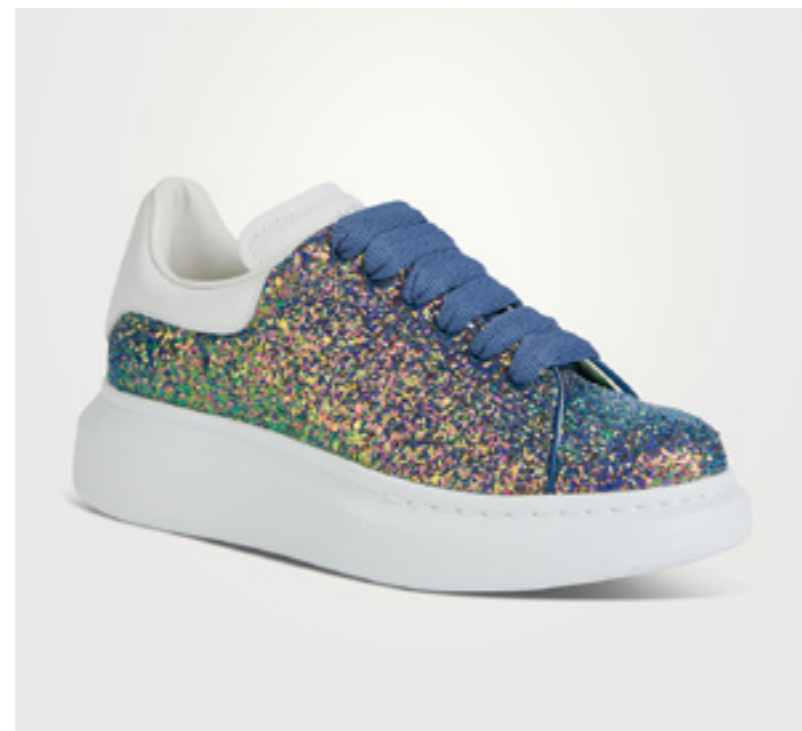
ALEXANDER MCQUEEN from Holt Renfrew Oversized Sneaker With Glitter $450 CAD

The Kids First Classic Giant Glitter Rain Boot is perfect for puddle splashing. Handcrafted from natural rubber with a unique chunky glitter finish, the flat sole and rounded toe give little feet room to move and the updated 100% recycled polyester lining ensures complete comfort for every adventure. These sparkly blue boots are fully waterproof and feature a specially-developed tread to reduce slipping.