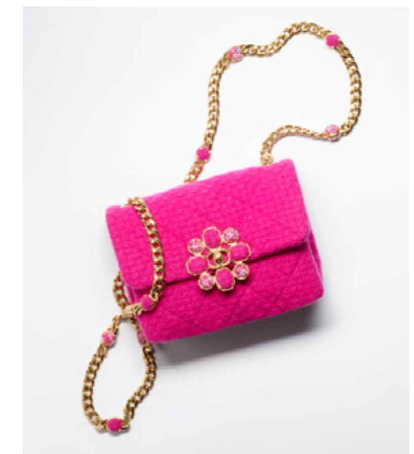
Chanel Mini Flap Bag $5,775 CAD

A playful shoulder bag designed in the shape of an apple with a top zip closure.