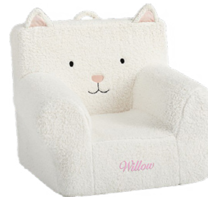
Anywhere Chair® Pottery Barn Kids Ivory Sherpa Kitty Chair $239 CAD

The world of Andy Warhol comes to life when his iconic and popular art is magically colored under water in this delightful bath book.