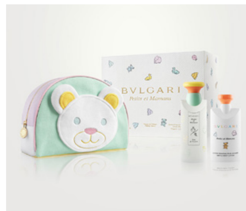
BVLGARI from Holt Renfrew Petits et Mamans Eau de Toilette 3-Piece Gift Set $96 CAD

The precious boxes, similar to hat boxes, reveal at their center an assortment composed of a plate, a bowl and a tumbler in extra fine Limoges porcelain with Toile de Jouy motif, and four stainless steel utensils that brighten little ones' days.