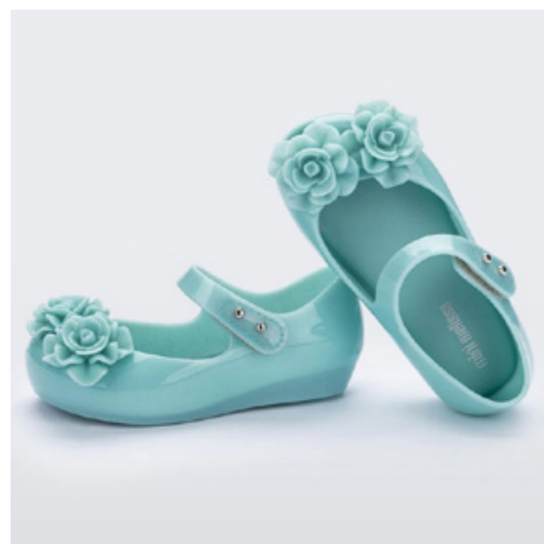
MINI MELISSA from KidBiz Ultragirl Garden Baby $80 CAD

Your little one will take center stage in snugly soft booties that showcase a logo patch on a hook-and-loop closure that ensures easy on and off.