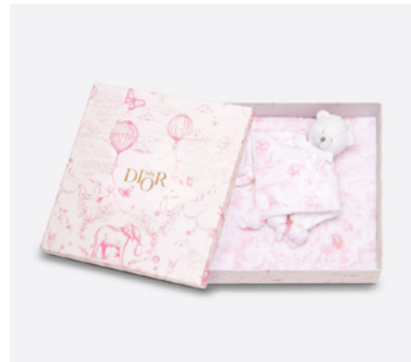
Dior Toile De Jouy Newborn Gift Set $510 CAD

The newborn gift set includes a swaddle blanket and a stuffed toy embellished with a pale pink all-over Toile de Jouy print on the top. The swaddle blanket is crafted in a soft muslin and cotton interlock blend and is adorned with a tonal 'DIOR' embroidery, while the stuffed toy features a velvet teddy bear with a grosgrain ribbon. The timeless and delicate set is an ideal gift for newborns.