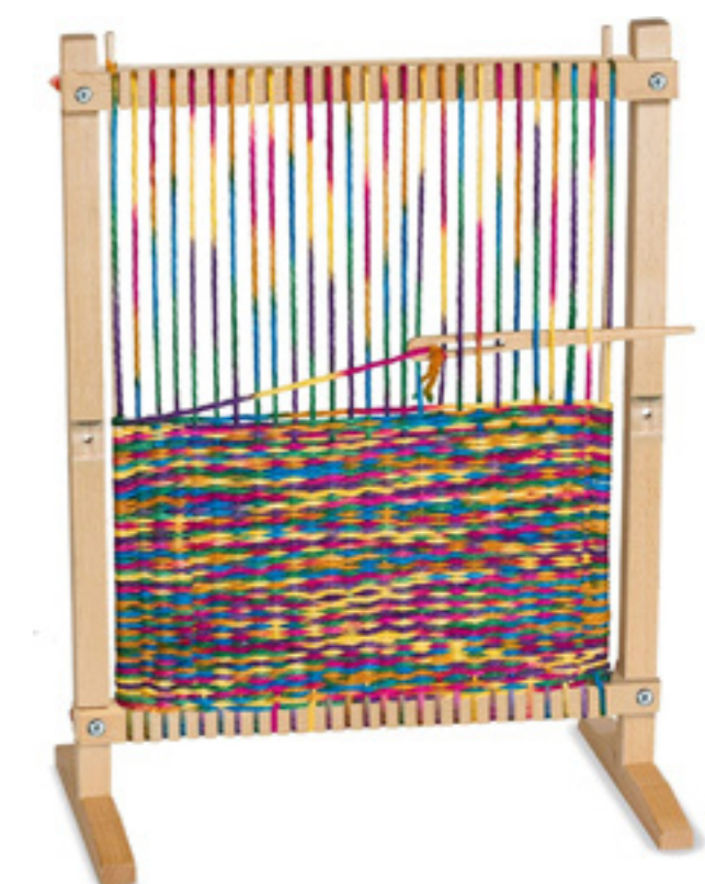
Melissa & Doug from Saks Fifth Avenue Multi-Craft Weaving Loom $61.77

Explore an original toy used in Waldorf and Montessori play: the Kinderfeets Large Wooden Arches in Rainbow! 12 stackable arches encourage children to sort, assemble and develop cognitively while enjoying imaginative free play.