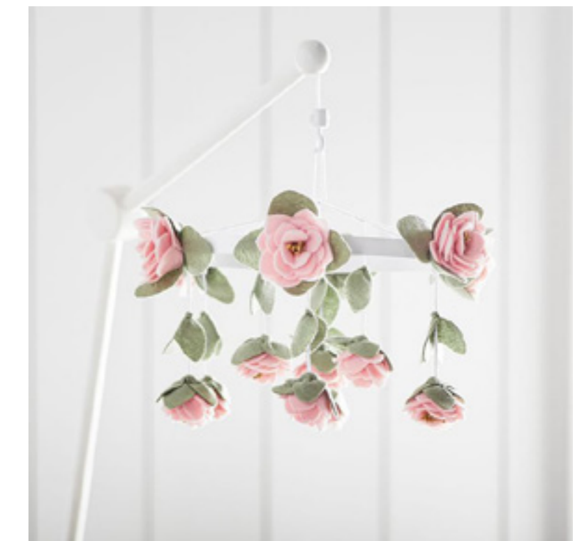
Pottery Barn Kids Felted Pink Roses Musical Crib Mobile $118.5 CAD

A friendly face makes this Anywhere Chair® even more fun for reading, relaxing and snuggling up. Designed with a kid-friendly handle, soft fabric and lightweight materials, it's easy to any room in the house – and it's just their size.