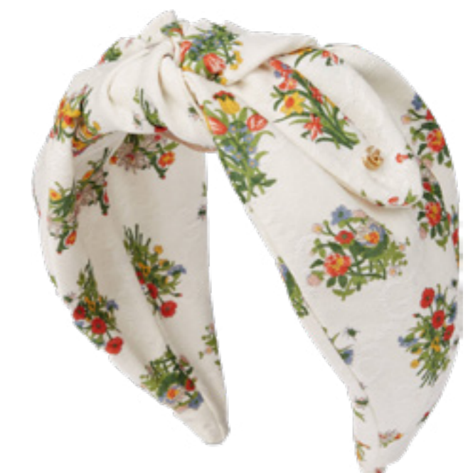
Gucco Children's GG Flora Bouquet Cotton Hairband $380 CAD

Recalling the golden days of Hollywood film, the bow tie is a signifier of evening elegance. Here the brown velvet accessory appears as a miniature version of the adults, adding a touch of glamour to Gucci's children's collection.