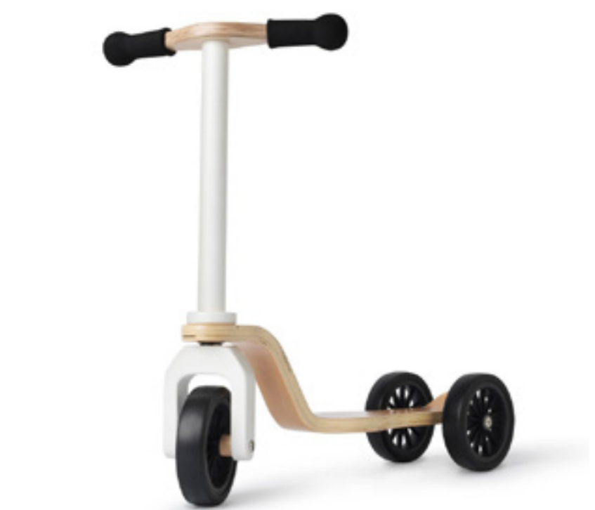
Kinderfeets from Indigo KINDERSCOOTER $144 CAD

Knitted from check wool, this signature teddy features a neat bow tie and hand-embroidered details.