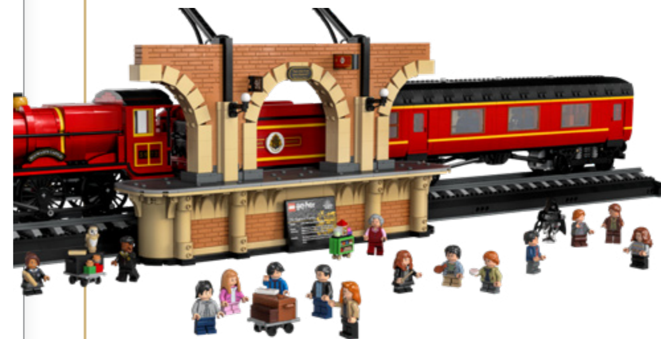
Lego Hogwarts Express™ – Collectors' Edition $619.99 CAD

All aboard! This oversized school bus is designed for little ones to haul around prized possessions, indoors or out, while the open roof makes loading up passengers a breeze. Made in the USA from recycled plastic with a sturdy, low-set design and chunky tires, it comes with a cotton rope handle that easily tucks inside for safe storage.