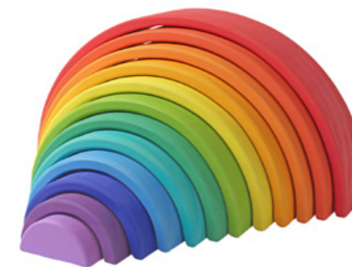
Kinderfeets from Indigo Large Wooden Arches, Rainbow $124.99

This 2x4, rectangular LEGO® brick-shaped drawer sits neatly on desks or shelves to provide convenient, easy-access storage for a variety of uses. It's ideal for use in offices, kids' rooms, bathrooms and anywhere else that needs to be tidy and organized.