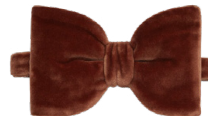
Gucci Children's Velvet Bow Tie $295 CAD

Adorning cascades of pink roses falling, this whimsical mobile will enchant your little one to sleep.