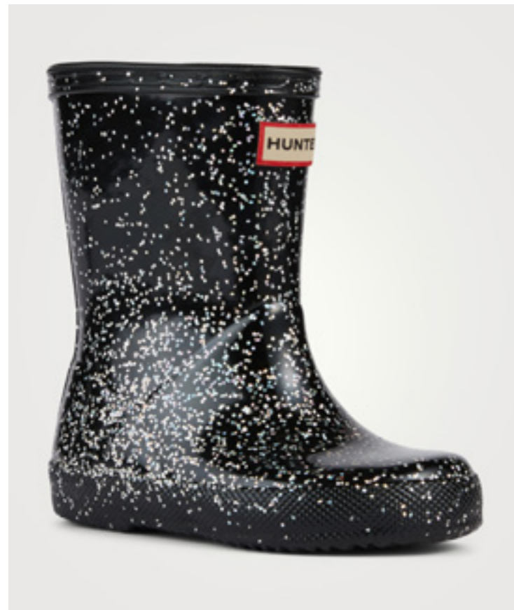
Hunter from Holt Renfrew Kids First Giant Glitter Rain Boots $85 CAD

The Kids First Classic Giant Glitter Rain Boot is perfect for puddle splashing. Handcrafted from natural rubber with a unique chunky glitter finish, the flat sole and rounded toe give little feet room to move and the updated 100% recycled polyester lining ensures complete comfort for every adventure. These sparkly blue boots are fully waterproof and feature a specially-developed tread to reduce slipping.