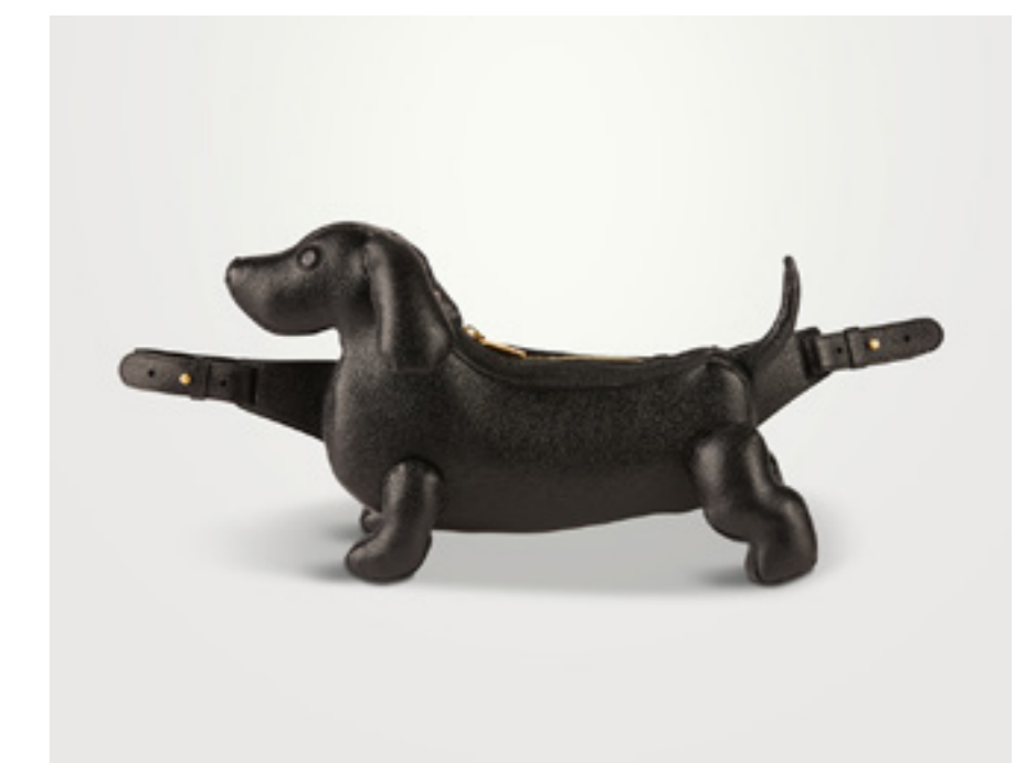
THOM BROWNE from Holt Renfrew Hector Pebble Grain Leather Chest Bag $2,760 CAD

The Hollywood Xmas Elizabeth pencil case displays a joyful travel scene. It features House mascot Vivienne sipping a milkshake while a teddy bear drives along Rodeo Drive. This piece coordinates with items from the Leather Goods and Accessories collections that also display this wanderlust-inspired design.