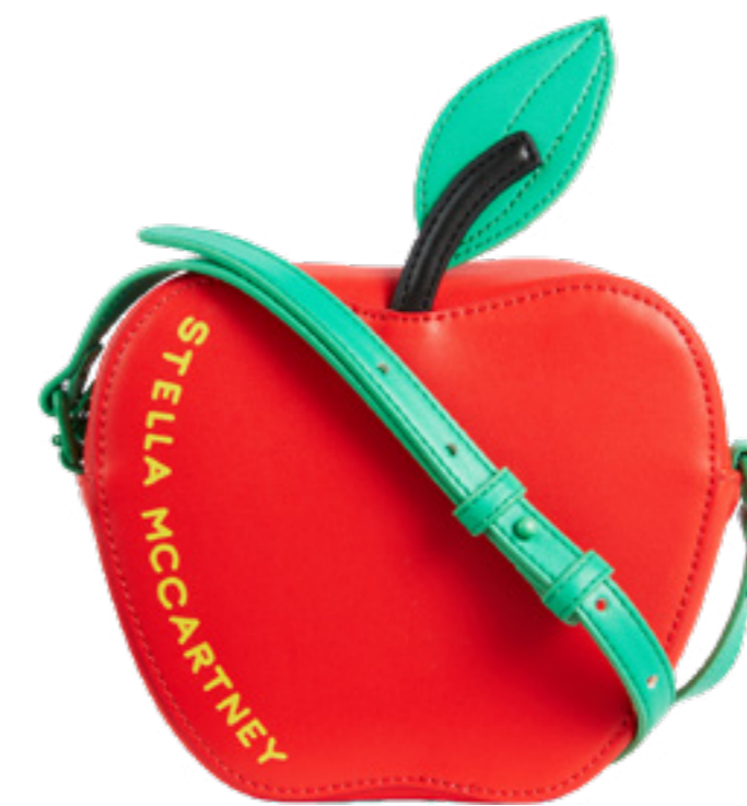
STELLA MCCARTNEY from Holt Renfrew Apple Shoulder Bag $185 CAD

A playful shoulder bag designed in the shape of an apple with a top zip closure.