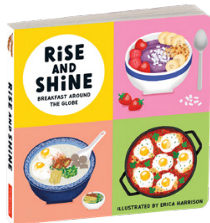
RAINCOAST from Holt Renfrew Rise and Shine Board Book $13 CAD

Little Animal Memory Book This modern memory baby helps bring our mission to life by giving you a simple (and beautiful!) way to document all the darling moments of baby's first year. Mom will easily record special memories, without spending hours doing it. Perfect for you or as a gift, this guilt-free baby book helps mom remember baby's first year forever.