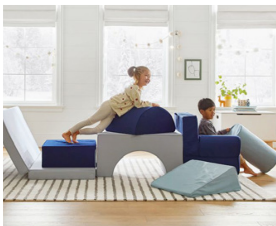
Pottery Barn Kids Anywhere Play Shapes Set $749 CAD

Petits et Mamans is an ultra-gentle aromatic-floral scent with a powdery character. It is designed for mothers and babies three years and older. Lorson set out to create a fragrance that would delight children and mothers – while being ultra-safe for children to wear.