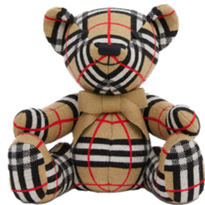
BURBERRY from Holt Renfrew Check Wool Thomas Bear $700 CAD

Jolly Gingerbread Fred is a biscuit buddy, full of merry mischief! Smartly dressed in rich, spiced fur, Fred wears cream cuffs, embroidered buttons and a suedey scarlet bow-tie. This ginger jokester loves running around, causing chaos wherever he goes!