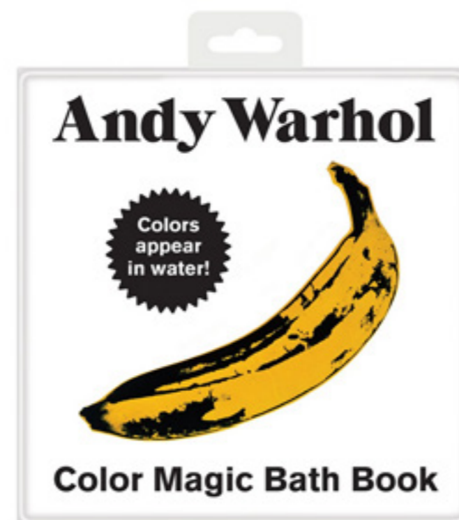
Mudpuppy from Barnes and Noble Color Magic Bath Book Andy Warhol $9.99 CAD

The Rise and Shine board book from Mudpuppy celebrates global and cultural awareness, teaches inclusion, and provides a window into other people's homes. This brightly illustrated board book with easy-to-read text includes breakfast items from around the globe such as churros from Spain, Mandazi from Tanzania, Cachapas from Venezuela and many more!