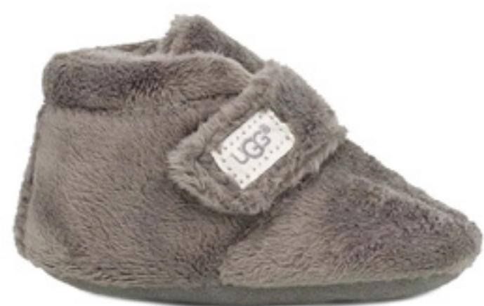
UGG from Nordstrom Bixbee Bootie $40 CAD

Crafted in smooth calf leather, this embellished lace-up sneaker is designed with a rounded toe and contrasting heel detail. Featuring an ALEXANDER MCQUEEN signature on tongue and heel counter, the leather sneakers are finished with large flat laces and a signature oversized rubber sole.