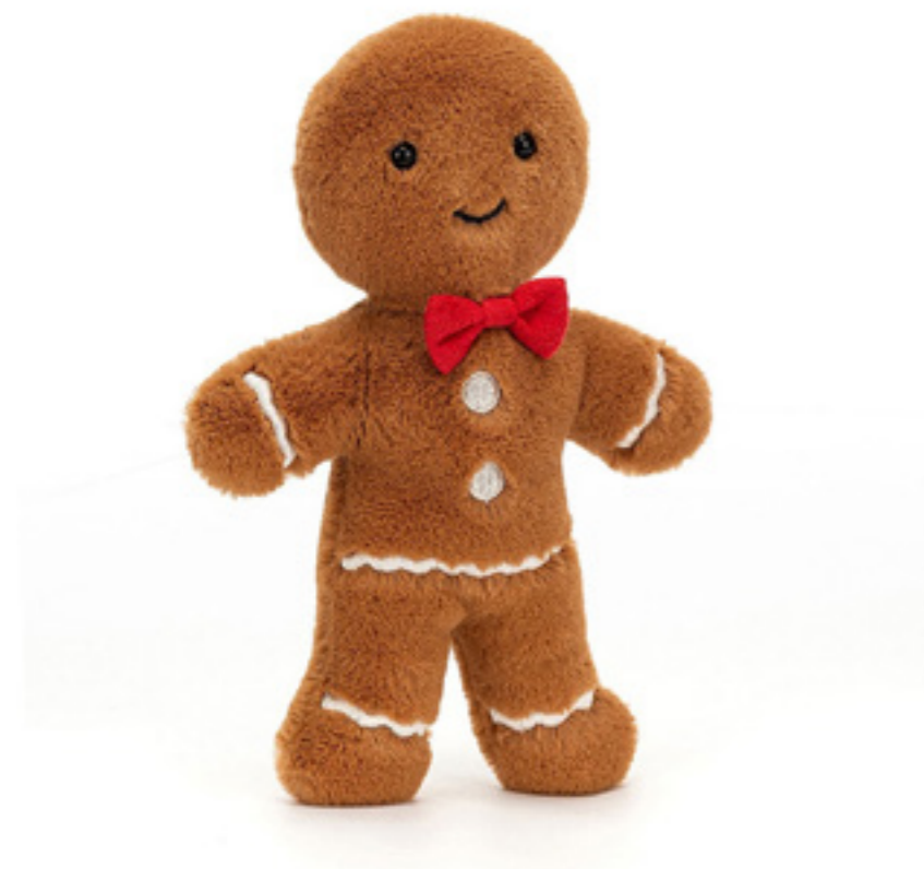
JELLYCAT from West Coast Kids Jolly Gingerbread Fred $75 CAD

Jolly Gingerbread Fred is a biscuit buddy, full of merry mischief! Smartly dressed in rich, spiced fur, Fred wears cream cuffs, embroidered buttons and a suedey scarlet bow-tie. This ginger jokester loves running around, causing chaos wherever he goes!