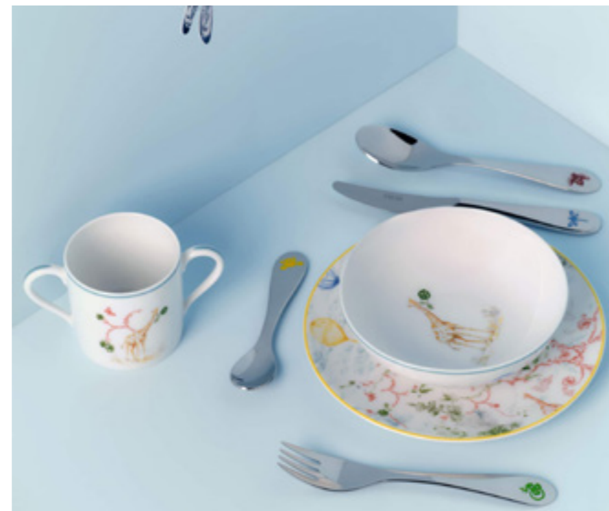
Dior My First Dinner Set $1650 CAD

The newborn gift set includes a swaddle blanket and a stuffed toy embellished with a pale pink all-over Toile de Jouy print on the top. The swaddle blanket is crafted in a soft muslin and cotton interlock blend and is adorned with a tonal 'DIOR' embroidery, while the stuffed toy features a velvet teddy bear with a grosgrain ribbon. The timeless and delicate set is an ideal gift for newborns.