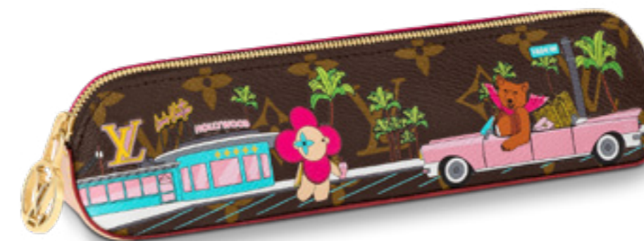
Louis Vitton Hollywood Xmas Elizabeth Pencil Case $625 CAD

The Hollywood Xmas Elizabeth pencil case displays a joyful travel scene. It features House mascot Vivienne sipping a milkshake while a teddy bear drives along Rodeo Drive. This piece coordinates with items from the Leather Goods and Accessories collections that also display this wanderlust-inspired design.