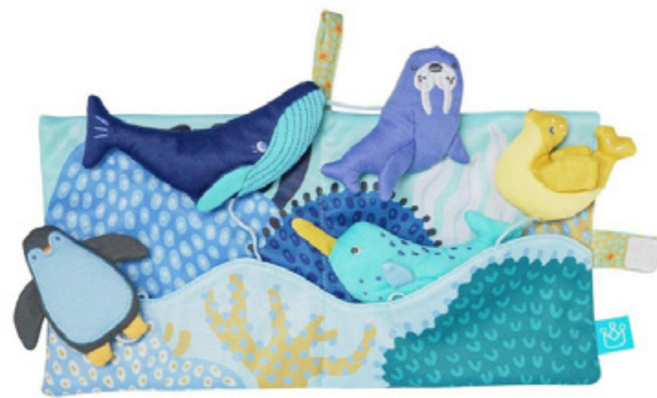
MANHATTAN TOY Arctic Adventures Bath Book $31.50 CAD

An arctic adventure for bathtime. The water-friendly soft book folds open, revealing sea-themed graphics and five tethered-on arctic creatures-walrus, penguin, whale, narwhal, and seal. A pocket allows for stashing creatures away for peek-a-boo fun. When playtime's over, squeeze out excess water and hang to dry. The Arctic Adventure bath book is the perfect addition to tubby-time play. Machine washer and dryer safe.